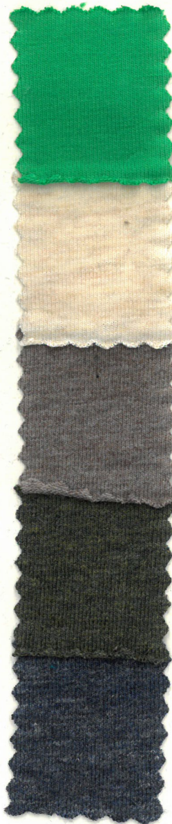
T545 KELLY GREEN