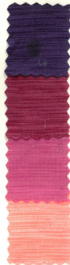
790 HEATHER AMETHYST