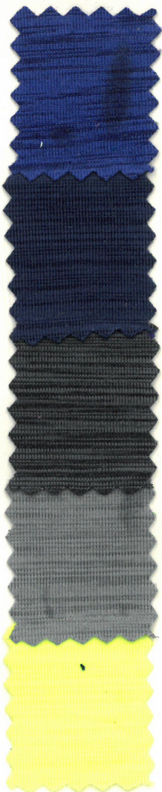
6899 HEATHER ROYAL