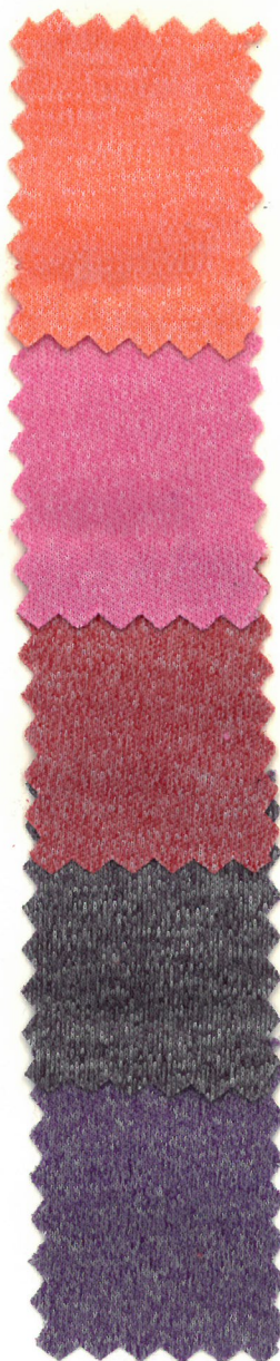
369 FRESH SALMON

CHITOSANTE* TREATMENT with ANTIBACTERIAL and WICKING PROPERTIES